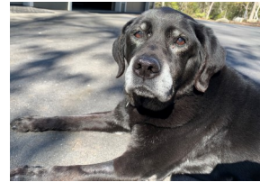
Rosie & Willow (Leary)