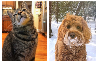
Rudy & Bingo (Scharff)